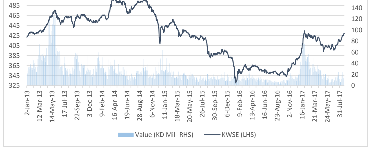
Chart 1. Kuwait Weighted Index Historical Performance with Value Traded (KD Mil)